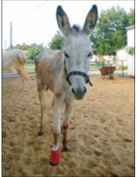
BEST HOOF FORWARD: A victim of the cruel practice of 'hobbling', Muriel now faces a brighter future thanks to your help

P lease ask your local vet for any short date dosages (these are medicines that are due to