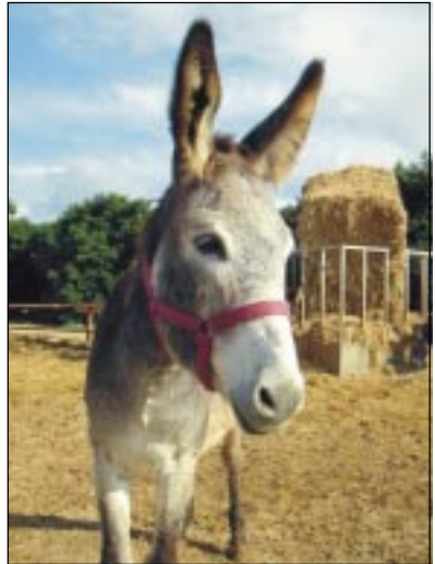
SHEEP IN WOLF'S CLOTHING: Gentle 'bad-boy' Clyde

W hen it comes to people, Clyde is one of the most loving and gentle donkeys to be around. One can