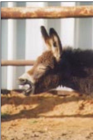
'EARS' A GOOD ONE: Little Blossom caught laughing at one of her own jokes...

Becky very kindly offered her services as a web developer. Thanks Becky!