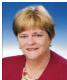
SEEING FOR HERSELF: SHADH Patron The Rt Hon Miss Ann Widdecombe MP

Full news and pictures of Miss Widdecombe's trip to Israel will feature in the Summer 2004 edition of our newsletter.