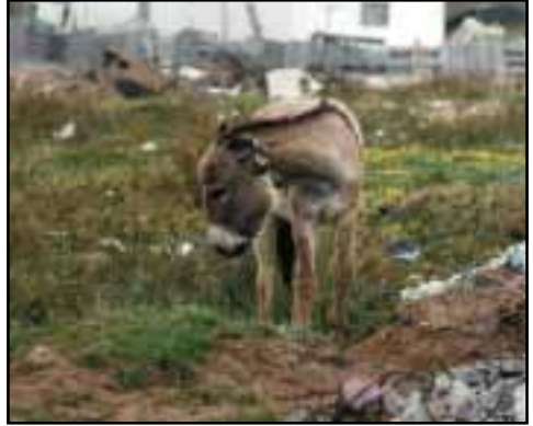
A PICTURE OF LONELINESS: One of the sad, abused donkeys of Jisr Alzarka

Nearby his body was the remainder of his little herd including a little grey female who had also had her ears chopped.