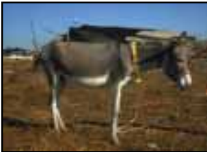
THAT WAS THEN: Silvy when she first arrived

She adores hanging out with the other donkeys and she and fellow madam, Tippy, recently started a bit of a girlie gang thing going!