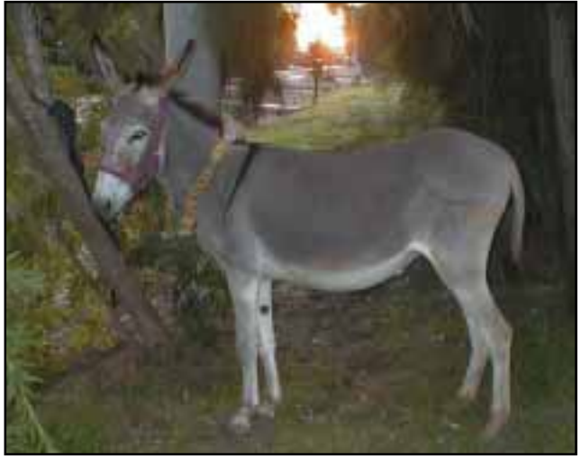
LOOK AT ME NOW! A happy and healthy-looking Silvy enjoying a beautiful Safe Haven sunset

Silvy and Tippy take turns leading the gang but more often than not it's Tippy so we call them the Tippy Gang!