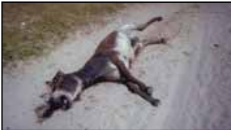
PEACE AT LAST: a victim of ignorance

Inevitably by this time we had aroused some interest and I'd just managed to put the most timid and terrified of the little donks into the trailer when a boy came and grabbed the little grey female with no ears, insisting that she was his. Then a young man came over and said that the other three belonged to him.... My heart absolutely sank... By this time the municipality had