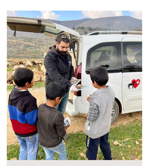
Our community projects in the West Bank seek to embed practical knowledge and promote compassion, in order to change the way donkeys are treated.