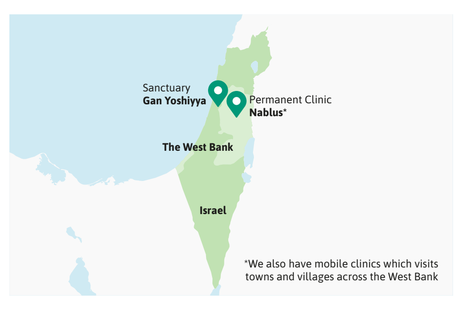
Our key locations in Israel and Palestine

We work not just with donkeys, but with all working equines, including horses and mules. The following pages outline the difficulties they face and what we are doing to ease their burden.