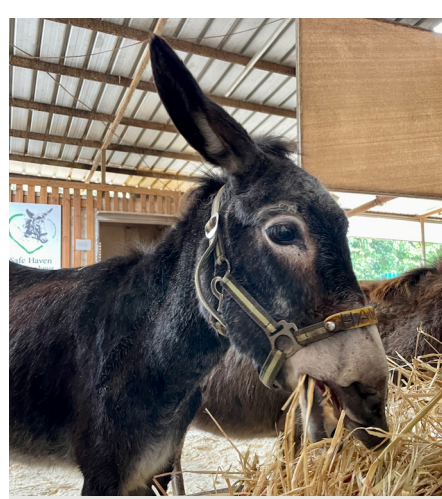
Safe Haven is a charity, which has been operating since 2000.

You can see our vision, mission and values in detail on pages 7 and 8.