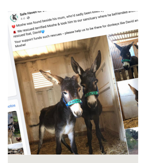
We raise funds to support our activities and have a strong social media presence where we engage with our supporters.

At our sanctuary in Israel we look after 180 donkeys that have been abandoned, rescued or handed over by their owners. From here we sometimes rehome donkeys and support their use in managing land in environmentally and welfare-friendly ways.