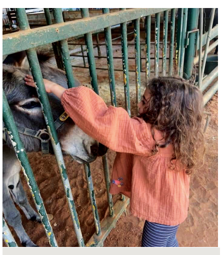
We have developed the sanctuary as a visitor attraction and educational facility.