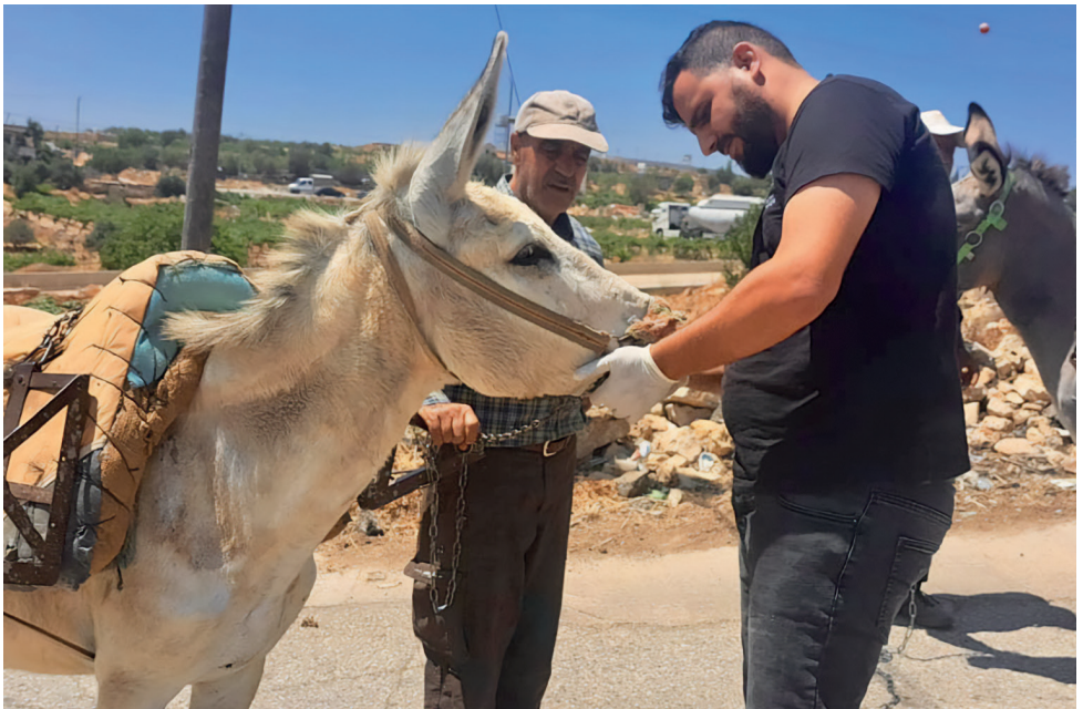
In Hebron, the team has overcome an increase in checkpoints to bring vital medical care to working donkeys.