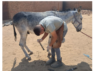
Our farriers perform an essential role - trimming overgrown hooves, easing lameness and relieving pain.