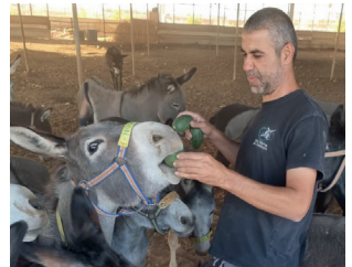
In Arrana, the small herd of rescued donkeys is thriving thanks to a nutritious diet, exemplary medical care and a lot of love.

At the Nablus hospital, a spacious surgical room is now complete and laboratory underway. In the coming weeks, the laboratory floor will be tiled and a specialist rubber floor fitted in the surgical room to make sure it's hygienic and easy to clean. In Arrana, the resident donkeys are steadily gaining weight after arriving malnourished. Most now have ideal body scores, with bright coats, playful energy and good appetites.