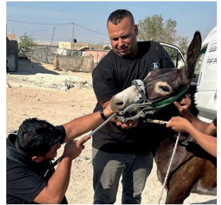
Despite an increase in roadblocks, the Tubas mobile team has been out on the road throughout 2025, treating donkeys wherever needed.