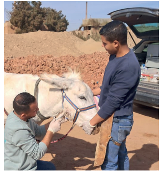
The team treating agonising wounds from ill-fitting harnesses and the heavy loads donkeys carry, bringing instant pain relief.

Need has also been identified in the communities around the kilns, where working donkeys transport families and carry goods. In the coming year, we have plans to establish a community team to support owners and their animals.